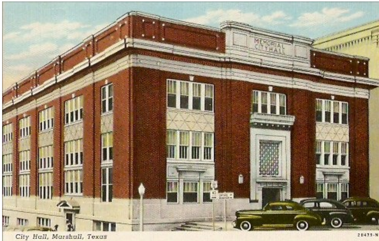
Figure 7: Marshall City Hall, circa 1940s

He also created the Marshall High School (1909) on West Houston St. Other area high school buildings he designed included Henderson (1917). East and West End Elementary Schools in Marshall (1917) Overton (1916) Mineola (1924) Mineral Wells (1913) and Avinger (1935)