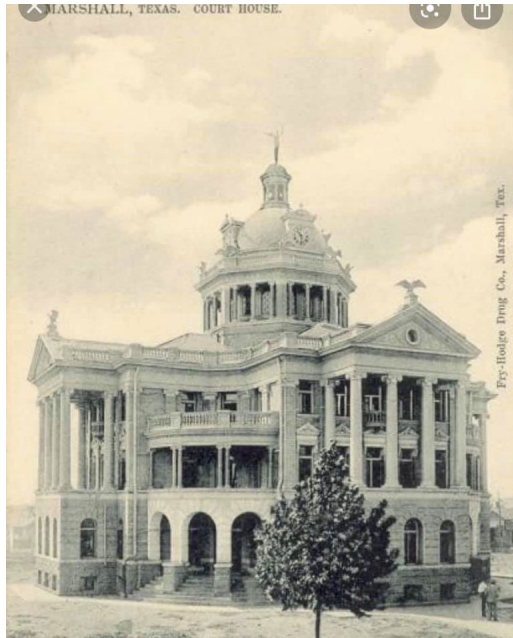
Figure 2: Courthouse prior to wing expansion

"From the outside, it may appear that Gordon simply draped Beaux-Arts features over his Signature Plan for Harrison. Inside, however, the style allowed a major change to his central core. Relieved of the structural necessity of a forest of piers, Harrison has an open rotunda with a grand flight of steps leading to the second-story district courtroom doors. The staircase is made of cast iron with imposing art nouveau newel posts and marble treads. Brackets cantilever from the walls to support the second and third floors of the rotunda, leaving their circular balustrades unobstructed. Acanthus leaves and electric lights decorate these brackets. Ancillary stairways at the corner of the rotunda lead to the third floor and courtroom balcony. Art glass lights pierce the lowest level of the of the courthouse dome."