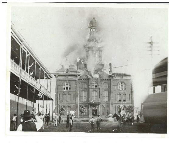
Figure 1: Photo of old Harrison County Courthouse (the Little Virginia Courthouse) burning in 1899

The first, and perhaps only, project the two collaborated on was the Harrison County Courthouse which began construction in 1899, following a fire which completely destroyed the one built only ten years previously. According to Harrison County Court records, the contract with the two architects was signed within a month of the fire because the commissioners wished to stave off any campaigns to change the location of the county seat. No other architects were considered. ii