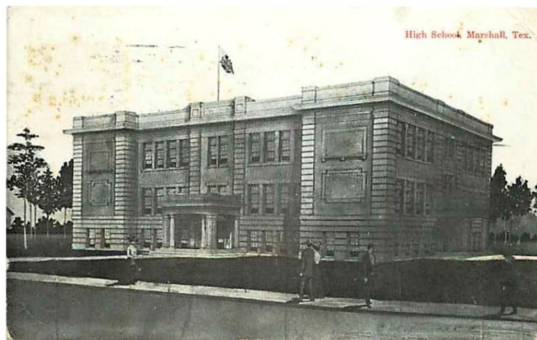
Figure 8: Old Marshall High School on West Houston St.

He also created the Marshall High School (1909) on West Houston St. Other area high school buildings he designed included Henderson (1917). East and West End Elementary Schools in Marshall (1917) Overton (1916) Mineola (1924) Mineral Wells (1913) and Avinger (1935)