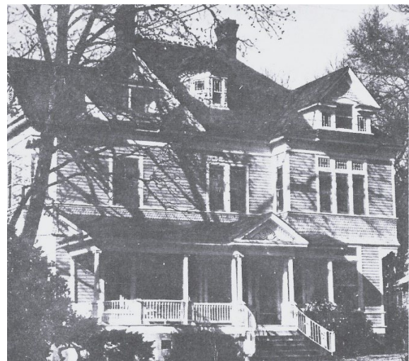
Figure 6: Weisman-Hirsch home on South Washington