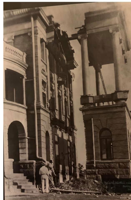
Figure 3: Expansion of the Courthouse wings