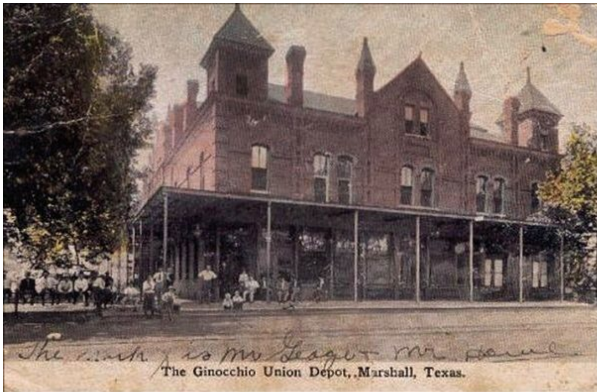
Figure 4: The Ginocchio Hotel in Marshall, early 1900s